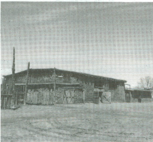
Several buildings of the HUBBELL TRADING POST at Ganado, Arizona. Warehouse in foreground and store at far right.