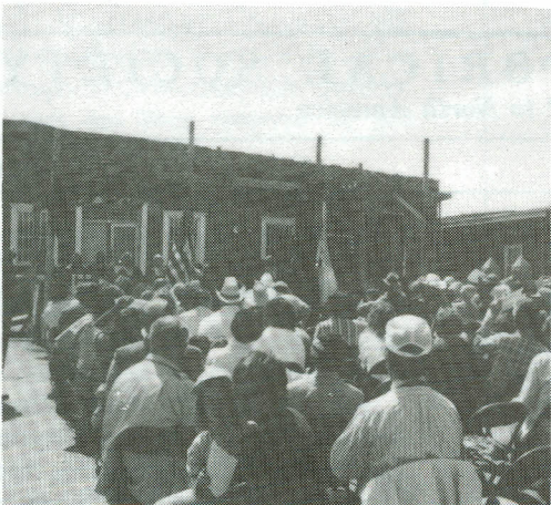
The audience (many standees not shown) at the rededication of HUBBELL TRADING POST as a National Historic Site.